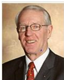
Carl-Wilhelm Stenhammar Foundation Trustee Chair

As February is World Understanding Month it could be a good time to think of the international service provided by Rotarians, clubs, and districts in light of the Future Vision pilot.